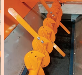
Kit for spreading dry chicken-manure