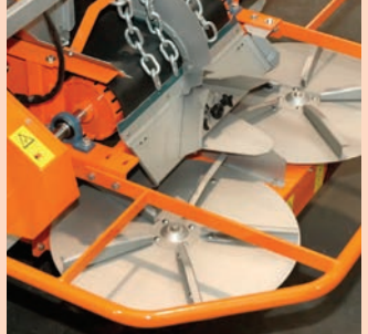
Wet lime spreading unit